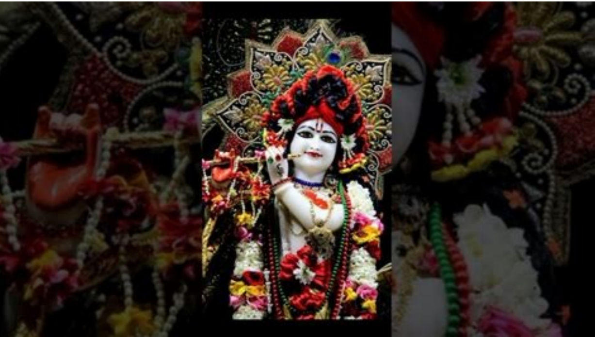
Baby krishna songs tamil mp3 download. Baby krishna songs tamil download.